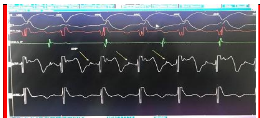
Figure 3: Electrophysiological tracing showing diastolic potential during tachycardia leads the QRS