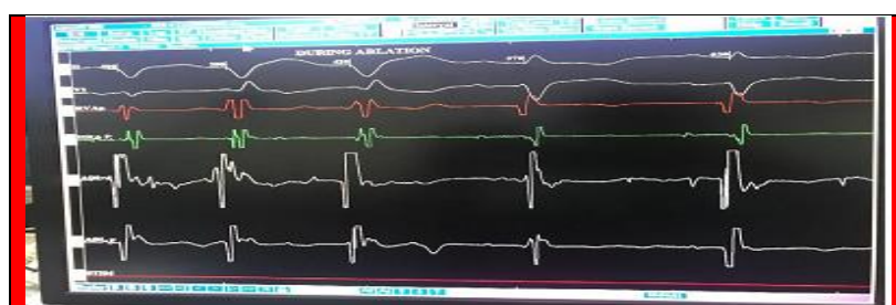
Figure 4: Electrophysiological tracing through effective ablation showing termination of tachycardia