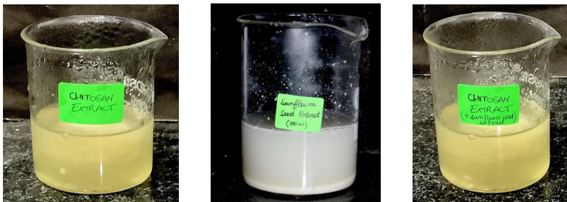
FIGURE 1: Chitosan- Sunflower seed gel preparation from Sunflower seed extract and Chitosan extract.