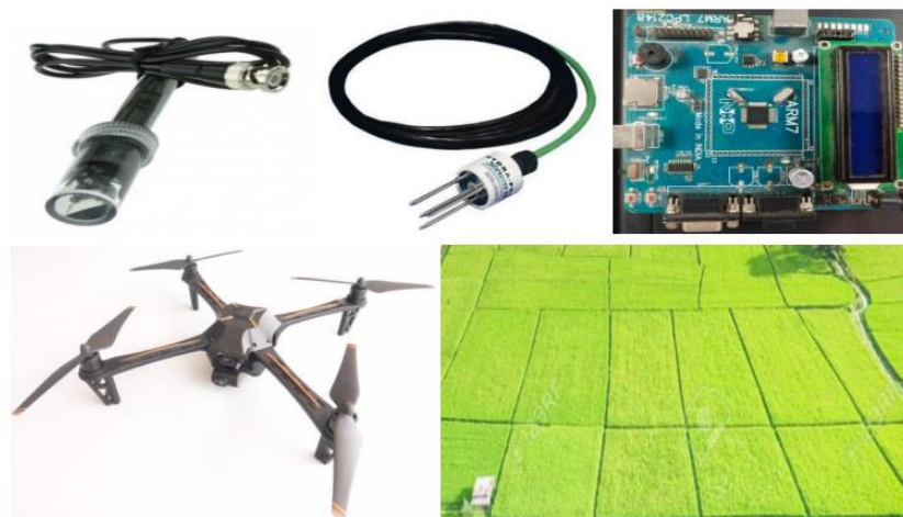
FIGURE 2: The pH Sensor, Dielectric soil moisture sensor, ARMv7 Controller, Hyperspectral sensor equipped drone and Agricultural Field

ARMv7 Controller, Hyperspectral sensor equipped drone and Agricultural Field are displayed in Figure 2.