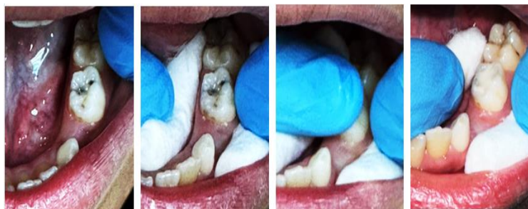
FIGURE 3: Restoration of the carious tooth with zinc modified resin glass-ionomer cement using the finger-press technique.