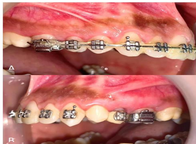
FIGURE 8: Assessment of wound healing on the 28th day. Complete wound healing was noted on both the sites (A) Test site and (B) Control site.