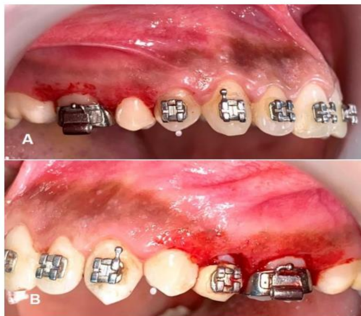
FIGURE 2: The open surgical wound created following Gingivectomy and Gingivoplasty. (A) Test site (B) Control site.

Gingivoplasty was performed using BP blade #15 and Orban periodontal knife to blend the bulky tissue, present in the buccal/labial and interproximal region (Figure 2).