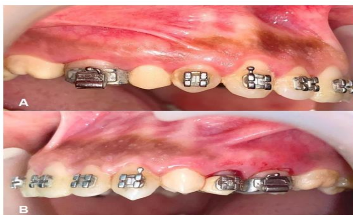
FIGURE 6: Assessment of wound healing on the 7th day (A) Remarkable healing noted on the test site (B) Slight redness still visible on the control site.

after three days for evaluation. The test site protected with Reso-Pac® can get dissolved within 3 days postoperatively. Coe-Pak™ on the other hand, does not have the ability to get dissolved and requires manual removal. Hence, Coe-Pak™ applied on the control site was removed for evaluation on the 3rd day, and a new Coe-Pak™ dressing was given. This was retained at the control site until the seventh day. They were requested to be present again on the 7th day (Figure 6), 14th day (Figure 7), 21st day (Figure 8), and 28th day (Figure 9) post-surgically. At each visit, the wound healing outcomes were evaluated for both sites using Landry's healing index 9 .