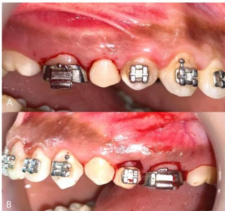
FIGURE 1: Pseudo pocket wall excised following gingivectomy A) Test site (B) Control site.

universal curettes 2R/2L or 4R/4L and then irrigated using saline (Figure 1).