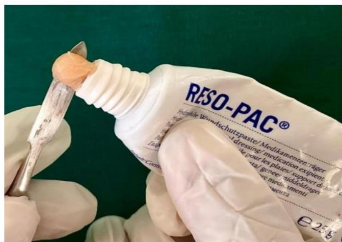
FIGURE 3: Dispensing of Pre-mixed Reso-Pac periodontal dressing

An adequate amount of Reso-Pac® was dispensed from the tube and onto thoroughly moistened gloves (Figure 3).