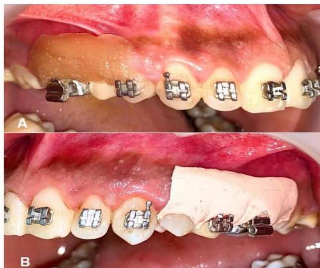
FIGURE 5: Periodontal dressing placed on the open surgical sites (A) Test site protected by Reso-Pac® (B) Control site protected by Coe-Pak™.

Postoperative instructions were given along with the recommendations to refrain from mechanical cleaning of the surgical areas. Patients were prescribed oral analgesic (Ibugesic 600 mg) immediately before the surgery and were advised to continue the same dose for 6 hours post-surgery. They were advised to rinse with 0.2% chlorhexidine mouthwash one-day post-surgery and twice daily for 15 days for oral hygiene maintenance.