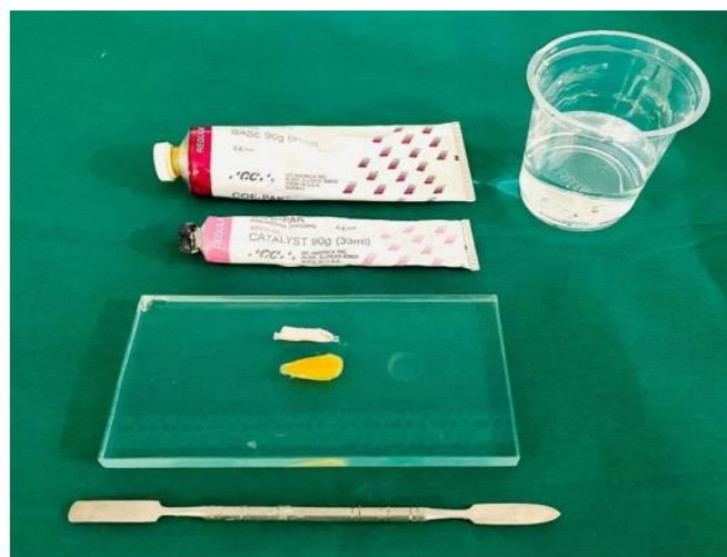
FIGURE 4: Equal streaks of base and catalyst paste of Coe- Pak dispensed on a glass slab

the base paste and catalyst paste on a glass slab and mixed using a cement spatula until a thick consistency and uniform color were obtained (Figure 4).