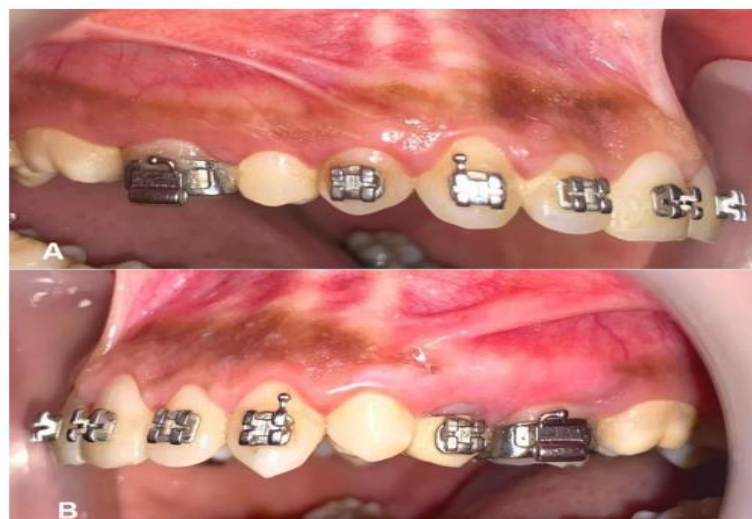
FIGURE 9: Assessment of wound healing on the 28th day. Complete wound healing was noted on both the sites (A) Test site and (B) Control site.