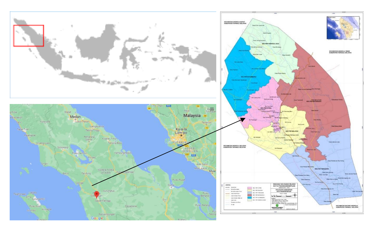
FIGURE 1: Padangsidimpuan City Map

traditional events, but the value of Dalihan Na Tolu in the future is expected to be applied through the involvement of family members in preventing disease. The type of disease that requires the participation of family members in giving attention and conveying health messages is Diabetes Mellitus Type 2. The consequences of type 2 diabetes mellitus (DM) are very serious for sufferers. This chronic disease can cause complications in small blood vessels, such as retinopathy and neuropathy, and in large blood vessels, such as myocardial infarction, angina pectoris and stroke. In addition to complications related to diabetes, the occurrence of hypoglycemic conditions, fear of hypoglycemia, and fear of long-term consequences can cause a decrease in the quality of life of patients. [8].