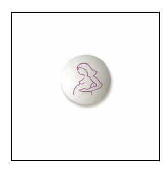
FIG. 4 Example of indicia used on a tablet to encourage women to use the product in pregnancy

While these findings must await more studies in pregnant women, this may be an important means to increase compliance and hence effectiveness of medications in pregnancy, with a parallel decrease in morbidity and need for hospitalization.