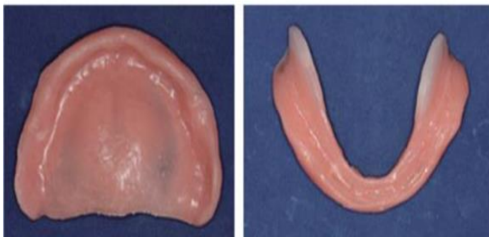
FIGURE 2: Shows the final impression taking using tissue soft liner.