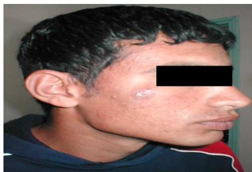
FIGURE 2: shown (a) L. infantum (b) L. tropica [8].