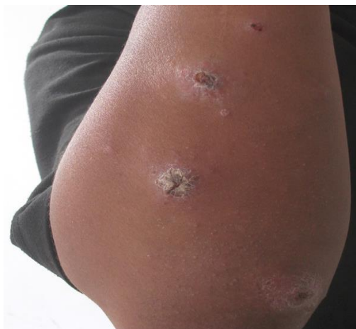
FIGURE 1: shown L. major [8]