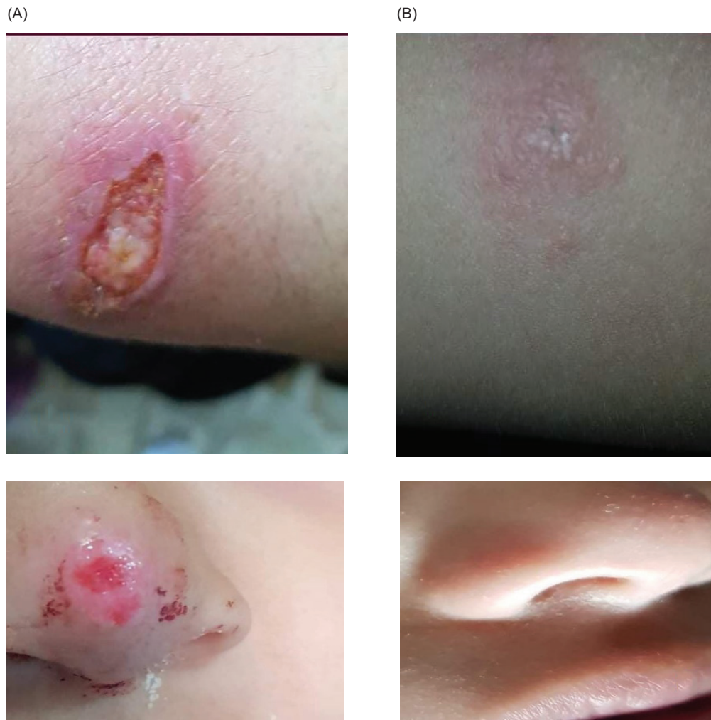
FIG. 1. (A) LCL before the treatment. (B) LCL after the treatment with intralesional levofloxacin.